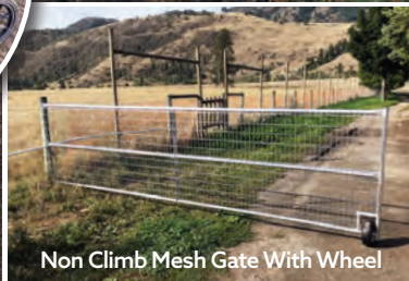
Non Climb Mesh Gate With Wheel