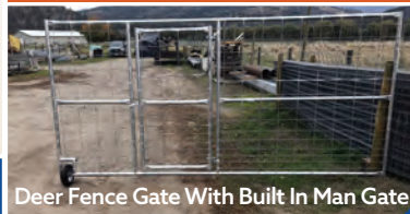
Deer Fence Gate With Built In Man Gate

pastured with a stallion who is registered and has a pedigree determined to be the best for the group of mares he is covering. Virtually all PMU broodmares and the stallions used to breed them are now registered stock. The typical equine ranch of today will specialize in producing quality foals of one of several different breeds, including Appaloosas, Quarter Horses, Draft breeds, Sport Horses where a Draft stallion is used on a Thoroughbred mare, and Warmblood breeds.